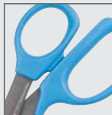
New Color Options