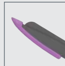
Matching Safety Guard on Nurse Patterns