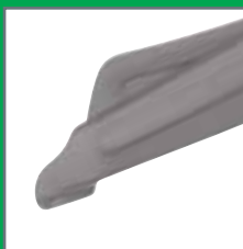
Fluoride Coated Blades